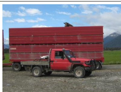
Hereford Steer destined for Maniototo and not too keen about it