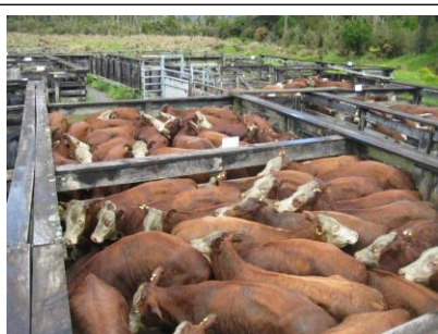
Glacier Horned Hereford – top Yearling Hereford Steers